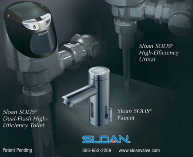
Sloan SOLIS® Dual-Flush High-Efficiency Toilet

Combining environmentally sound technologies with leading-edge electronics, the Sloan SOLIS® is designed to deliver continuous energy and water savings, while reducing operating and maintenance costs.