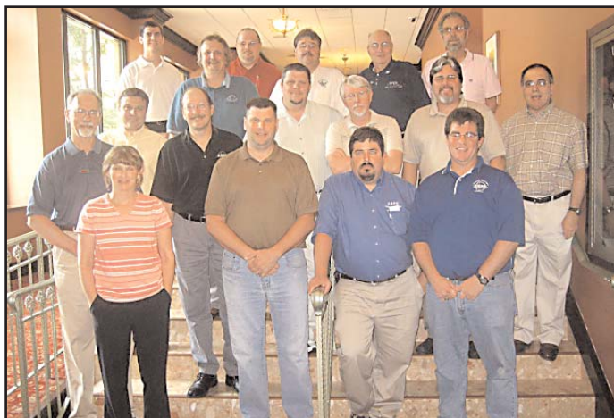
Region II Presidents Meeting