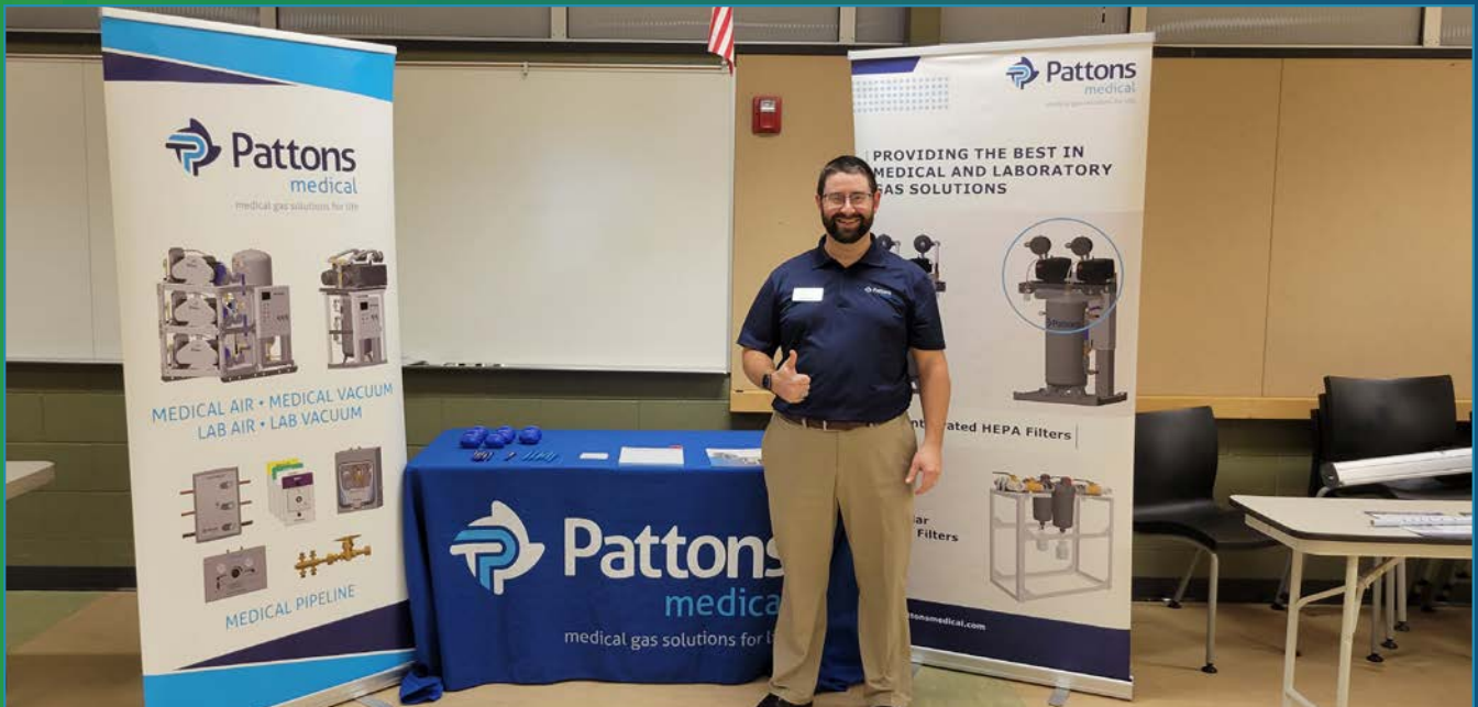
Thank you Pattons Medical for sponsoring!