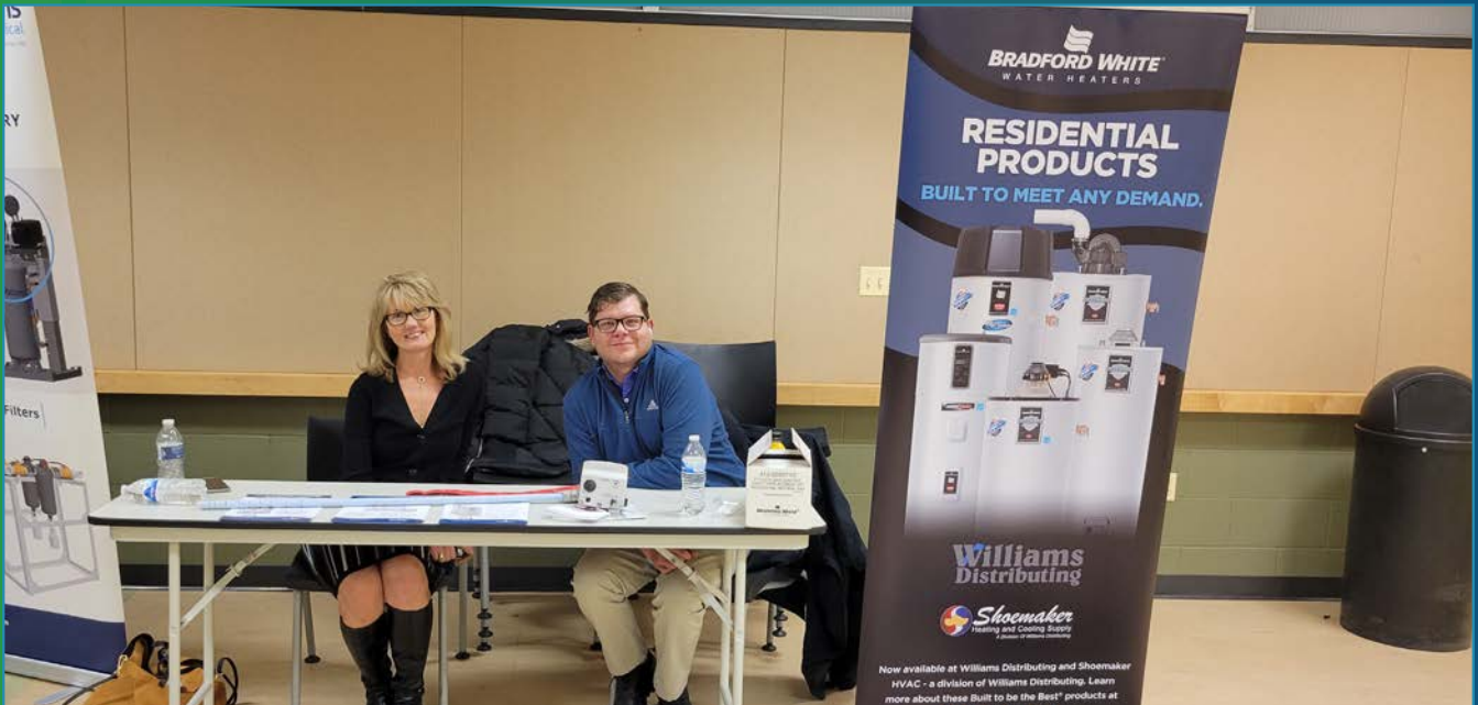
Thank you Burke Agency for sponsoring!