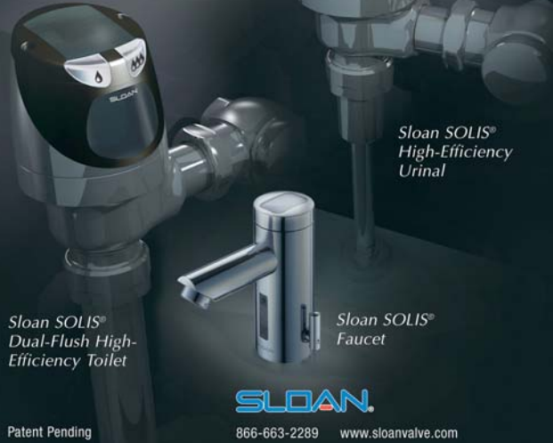
Sloan SOLIS® Dual-Flush High-Efficiency Toilet

Combining environmentally sound technologies with leading-edge electronics, the Sloan SOLIS® is designed to deliver continuous energy and water savings, while reducing operating and maintenance costs.