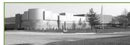
Plumbing Industry Training Center 1911 Ring Drive, Troy, MI 48083